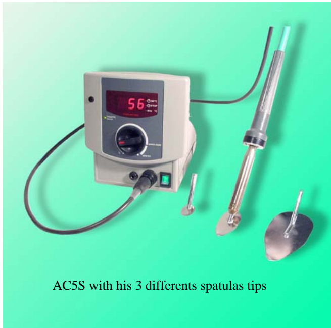
AC5S with his 3 differents spatulas tips

AC5S is a special Appliance designed for repairing, reworking...in a large field of Works as: